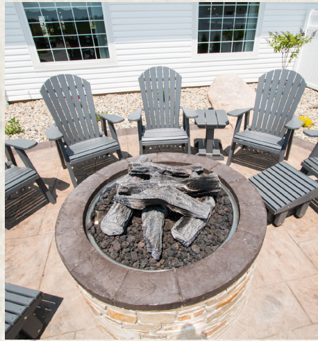
Blue Gate Garden Inn