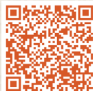
Pine Knob Trail